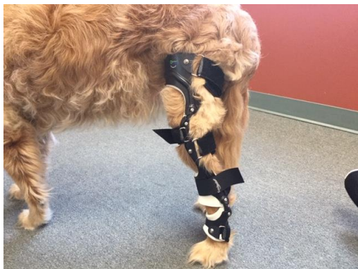
Left ACL Orthosis with a Tarsal Cuff